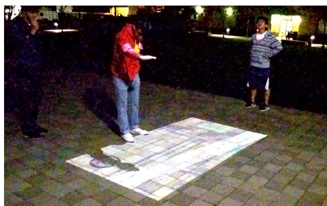
Figure 1. FlyMap in use in a tour guide context at Stanford University by a visitor defining what route to take using mid-air gestures.

DOI: https://doi.org/10.1145/3205873.3205877