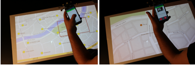
Figure 2. FlyMap Indoor Prototype (Left) Tactile: touch screen used to control the map. (Right) Spatial: phone as controller, with additional details about Points of Interest displayed on the screen.