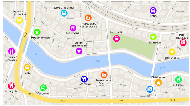
Figure 3. European-style Map 2 used in the Indoor Study for Task 3

We used a projector (LG PF80G), an Optitrack tracking system, and a phone (Samsung Galaxy Zoom K).